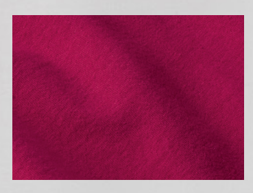
LIGHTWEIGHT 146 g/m<sup>2</sup> / Fabric 32/1 Pre-Shrunk 100% Combed Ring Spun Cotton*