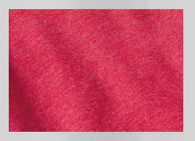
TRI-BLEND 159 g/m<sup>2</sup> / Fabric 32/1 Pre-Shrunk 50% Polyester/25% Combed Ring Spun Cotton/25% Rayon